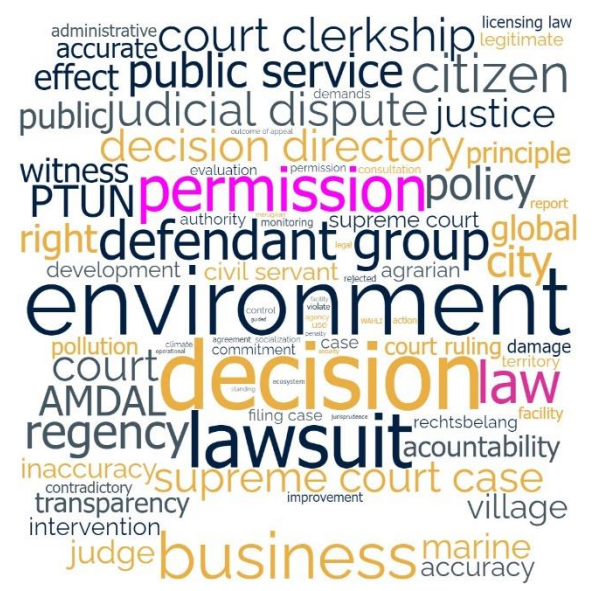
Figure 3. Word cloud results based on environmental case decisions

2022). Thus, it can be realized that the environment bears its rights and is not merely an instrumental part of human rights (Holm, 2023).